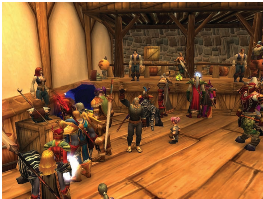
Fig. 1. The Stormwind Auction House in WoW. The three figures wearing vests and standing on platforms are the computer-generated auctioneers, whereas the dozen other figures are characters belonging to real human beings participating in auctions involving a thousand or more people. The one waving in the center is the avatar of a scientist who is studying this virtual world and the computer-assisted systems it provides to facilitate social interaction and economic exchange.

During this time of transition, when there is active speculation about the investment opportunities, it is exceedingly difficult to estimate the current economic impact of virtual worlds, let alone project the future. For example, a Web site called Wowhead that was merely about WoW recently sold for 1 million dollars, and the game’s $15 monthly charge across many subscribers could generate hundreds of millions of dollars per year (10). Virtual worlds differ as to whether their internal currency can be exchanged for dollars (SL, yes; WoW, no), so economists face the scientific dilemma of how to count wealth generation inside the games, in addition to the external dollar investments and returns. Exploratory studies by Nick Yee suggest that most players are in fact adults, disproportionately male but with a wide variety of occupations and demographic characteristics (11), so virtual worlds are not simply a childish fad. However