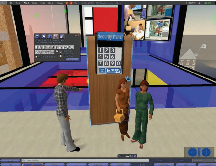
Fig. 2. Three avatars in SL making a door. In a virtual design studio, two scientists are admiring the work of a student intern (center) who is creating a set of displays demonstrating human-centered computing. After the combination lock has been set and made smaller, the door can readily be moved to its final location. Similar methods can be used to construct laboratory facilities and experimental equipment.

Political science uses the experimental method almost exclusively in small laboratory studies that mimic committee deliberations, and none of the social sciences experiment aggressively with social movements, simply because the cost and the ethical issues are daunting. This situation could change online, especially in role-playing games such as WoW, as long as the given experiment harmonized with the mythology of the virtual world. In the days before university committees on research with human subjects, it was not con-