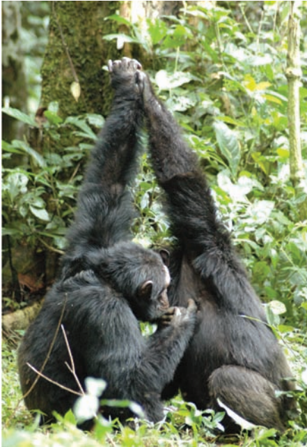
Fig. 6. Two adult male chimpanzees in Kanawara groom. Male chimpanzees participate in a variety of cooperative activities and form close social bonds.

izations of at least 100 other individuals (53); bottlenosed dolphins ( Tursiops aduncus ) form stable multilevel alliances (54); and rooks ( Corvus frugilegus ) console their partners after conflicts with other members of their flocks (55). For individuals in these species, there may also be important social components of fitness.